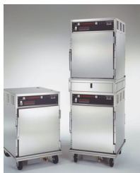
Above: SmartHold HHC 993 half-size heated holding cabinet